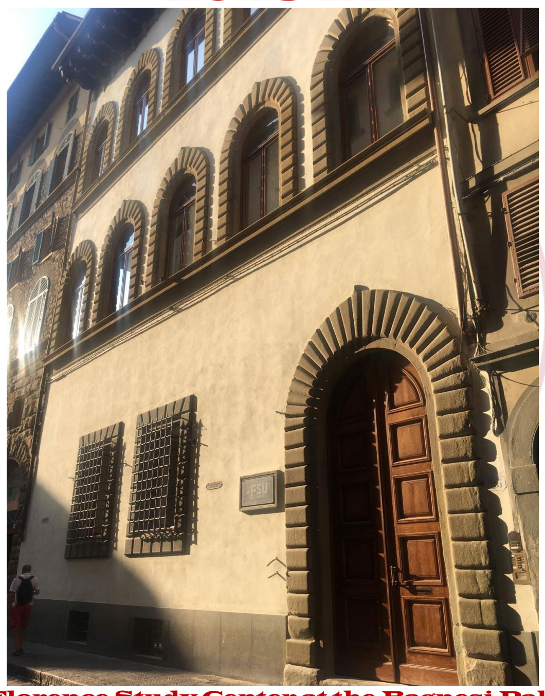
FSU Florence Study Center at the Bagnesi Palace